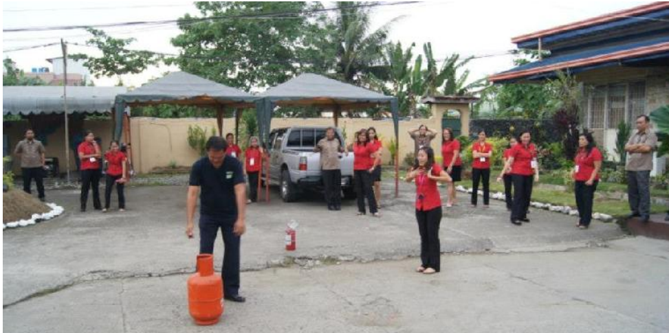
Selected regional personnel went through the fire drill outside the office.