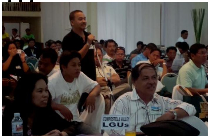
An inquiry was raised by a participant from the Compostella Valley during the Open Forum of the River Basin Collaborative Workshop