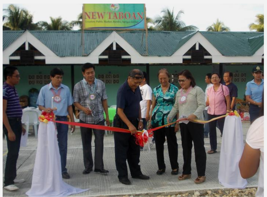
The newly opened market site road of the New Taboan in Barobo, Surigao del Sur.

The expansion of Barobo commercial site is situated just within the public market where consumers, traders and passing-through travelers converge in the place. The plan is aimed to beef up the economic activity of the municipality centered in one area where trade and commerce take place. This plan however would entail a market site peripheral road that provides easier and convenient access road within the area for improved delivery of basic service to the community. The challenge now lies on the LGU to fund the proposed market perimeter road, or otherwise fund a funding agency to finance the said project.