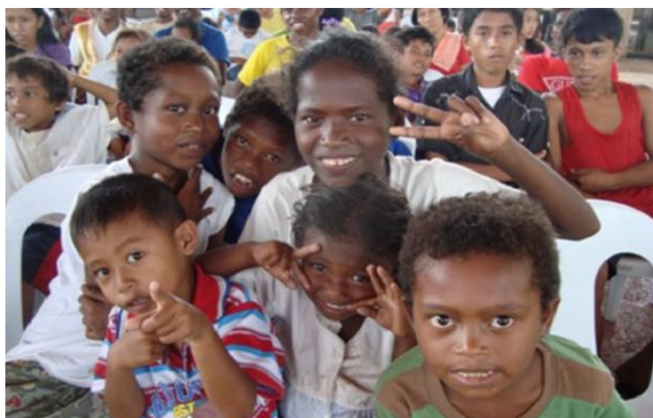
The child laborers, labeled as "batang kalabaw" of Jabonga, Agusan del Norte who were engaged to do hard labor were granted with educational kits.

Department of Environment and Natural Resources (DENR), National Commission on Indig-