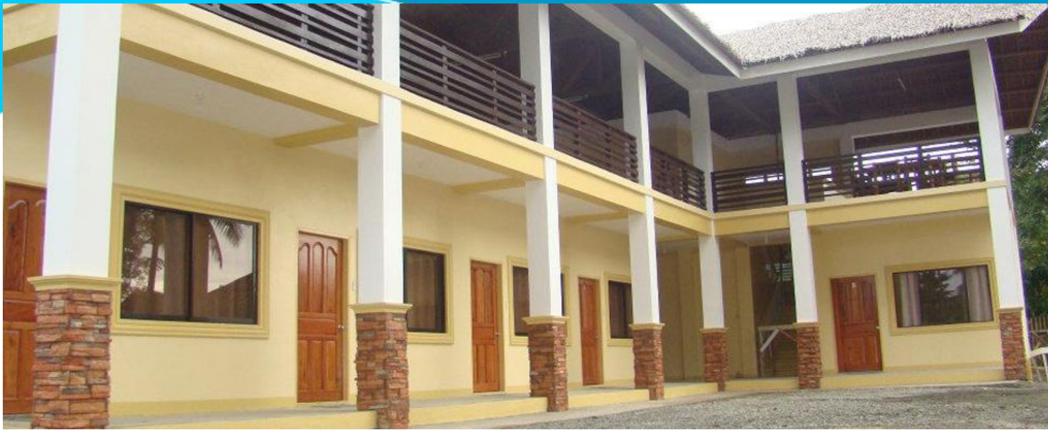
Surf Camp is a two-storey multi-purpose building funded by DILG's Performance Challenge Fund

Lanuza, "the Surfing Gateway of the Philippines" - For the past ten years, it has been hosting surfing competition every November. Tourists from different parts of the country and even around the world like Australia, Canada, Japan and the United States visit the place for the annual Surfing Festival and other tourist destinations such as the Campamento Cave, the Magkawas Falls, the Marine Sanctuary and the Century-old Ancestral House. However, because of no hotels available in the place, the Municipality has found difficulty in accommodating its guests.