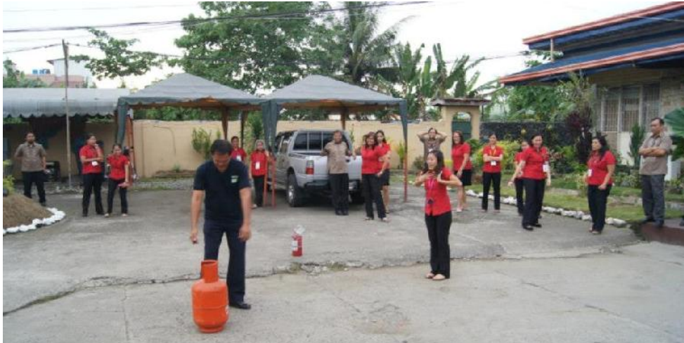
Selected regional personnel went through the fire drill outside the office.

Regional personnel of DILG Caraga went through a fire drill and safety lecture in order to equip them with the correct and standard responses to fire incidents by the Bureau of Fire Protection (BFP) on October 21, 2012.