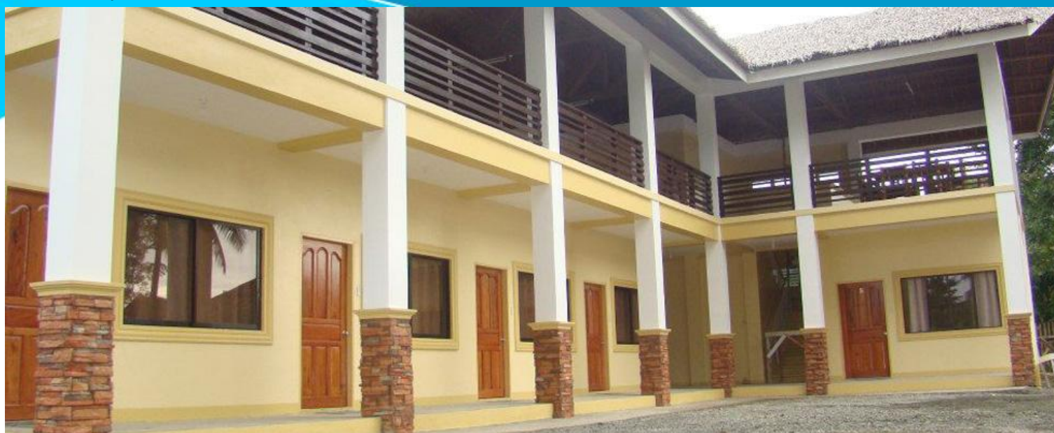
Surf Camp is a two-storey multi-purpose building funded by DILG's Performance Challenge Fund

Lanuza, "the Surfing Gateway of the Philippines" - For the past ten years, it has been hosting surfing competition every November. Tourists from different parts of the country and even around the world like Australia, Canada, Japan and the United States visit the place for the annual Surfing Festival and other tourist destinations such as the Campamento Cave, the Magkawas Falls, the Marine Sanctuary and the Century-old Ancestral House. However, because of no hotels available in the place, the Municipality has found difficulty in accommodating its guests.