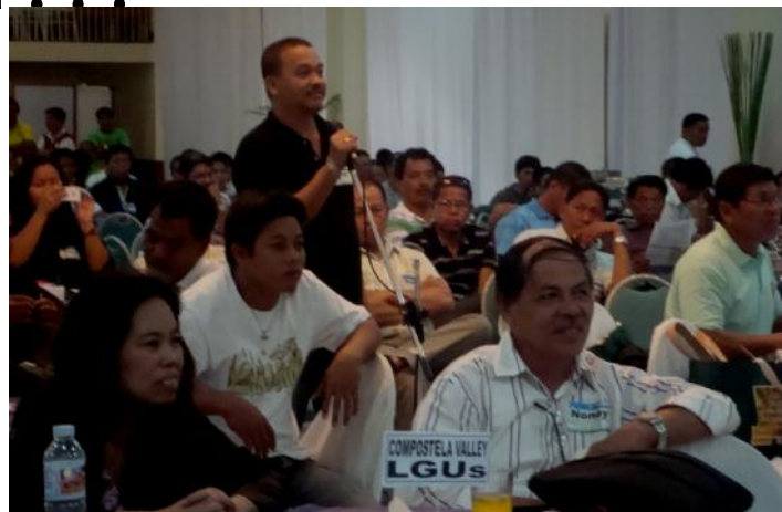
An inquiry was raised by a participant from the Compostella Valley during the Open Forum of the River Basin Collaborative Workshop