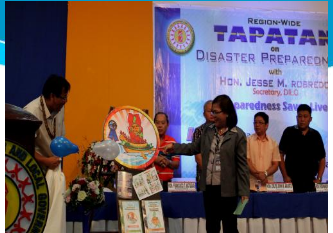
SILG Robredo with RD Famacion unveils the "Seal of Disaster Preparedness" with DRRM Compendium and Manual of Caraga RDRRMC and other IEC Materials for Disaster Preparedness.

The late Secretary of the Interior and Local Government Jesse M. Robredo has just launched the Seal of Disaster Preparedness during the Region-Wide TAPATAN on Disaster Preparedness.