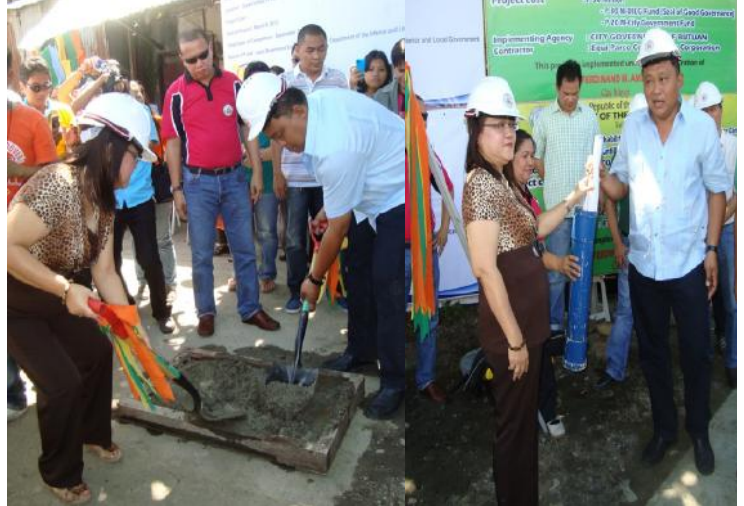
Director Famacion with Butuan City Mayor Amante, during the groundbreaking ceremony of Butuan Drainage System on April 18, 2012.

The City Government of Butuan, as a recipient of the Seal of Good Housekeeping (SGH) was granted with Php60 M from the national government's Local Government Support Fund (LGSF) through the Department of the Interior and Local Government Region XIII - Caraga (DILG XIII).