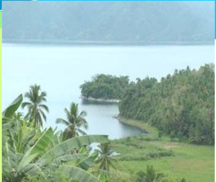
The exhilarating view of Lake Mainit from the overlooking peak of Lantawan Eco-Park at Brgy. Crossing, Kitcharao, Agusan del Norte.